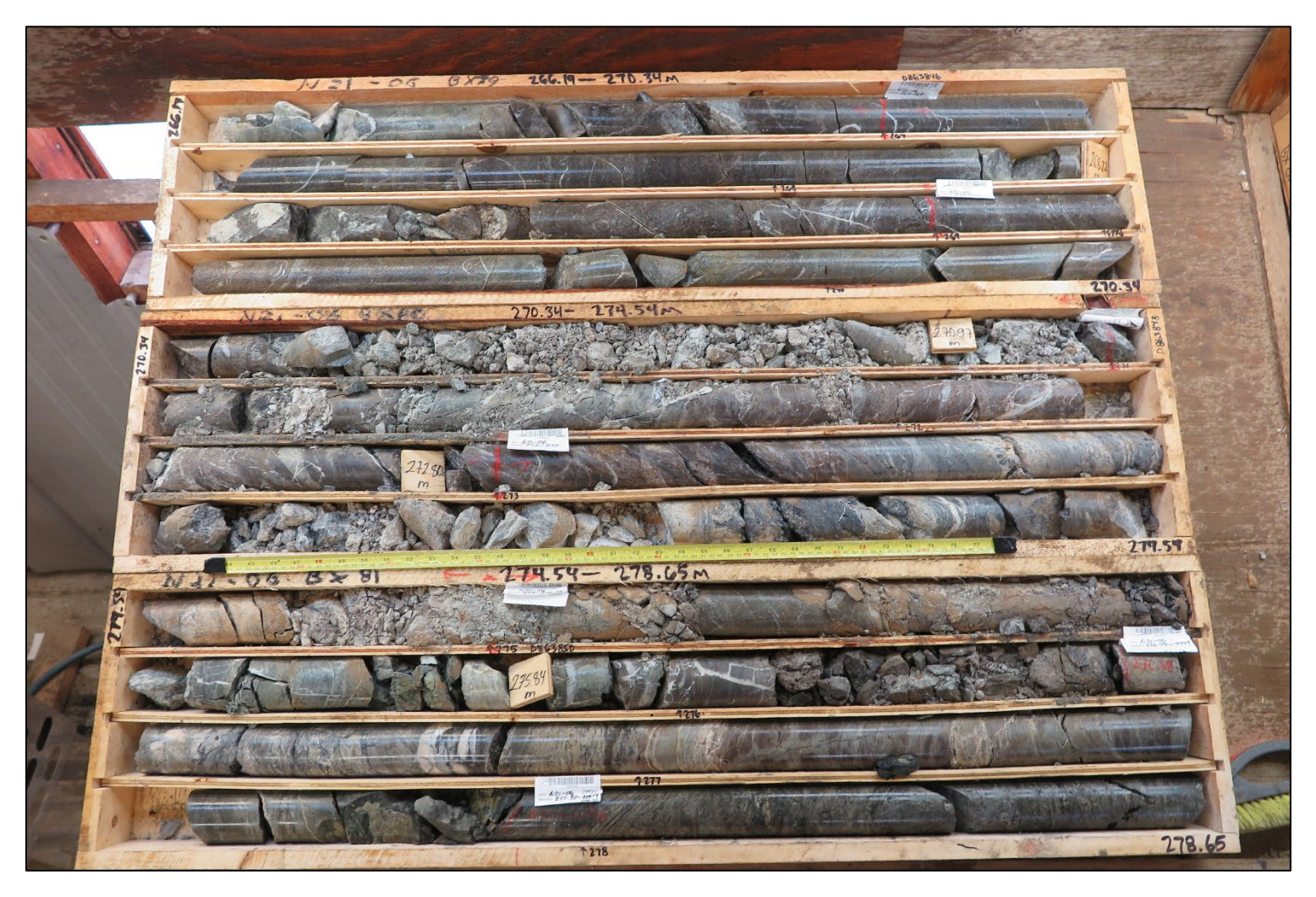
Figure 3. N21-06 Sulphide Zone. Interval from 276.38 to 277.90 metres assayed 2.01 g/t Au.