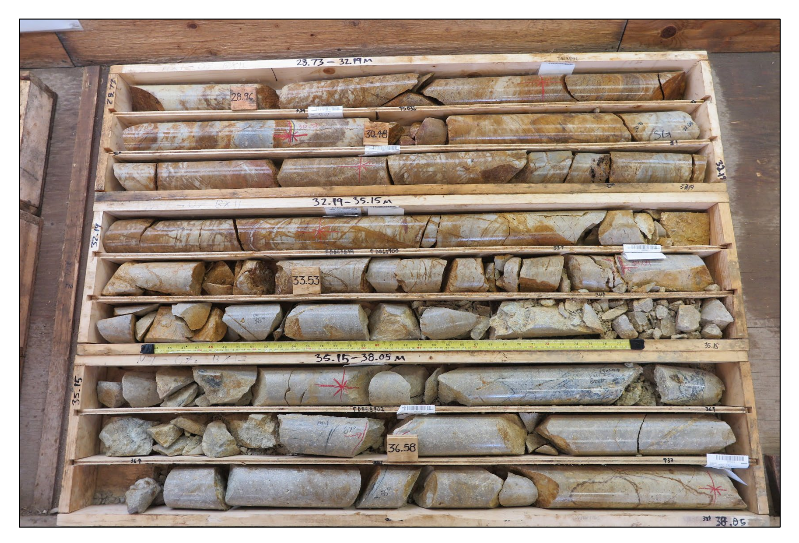
Figure 4. N21-07 Oxide Zone. Interval from 35.00 to 36.58 metres assayed 1.21 g/t Au.