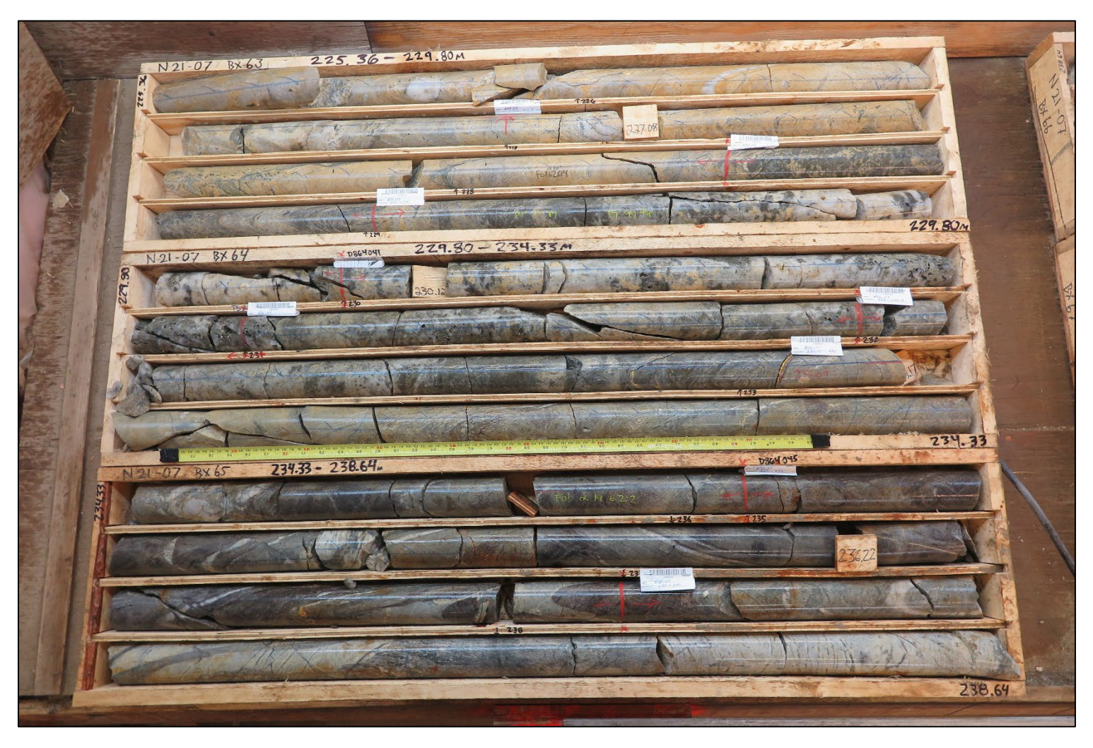
Figure 5. N21-07 Sulphide Zone. Interval from 229.00 to 239.00 metres assayed 0.53 g/t Au, including 3.49 g/t Au from 232.00 to 233.00 metres.