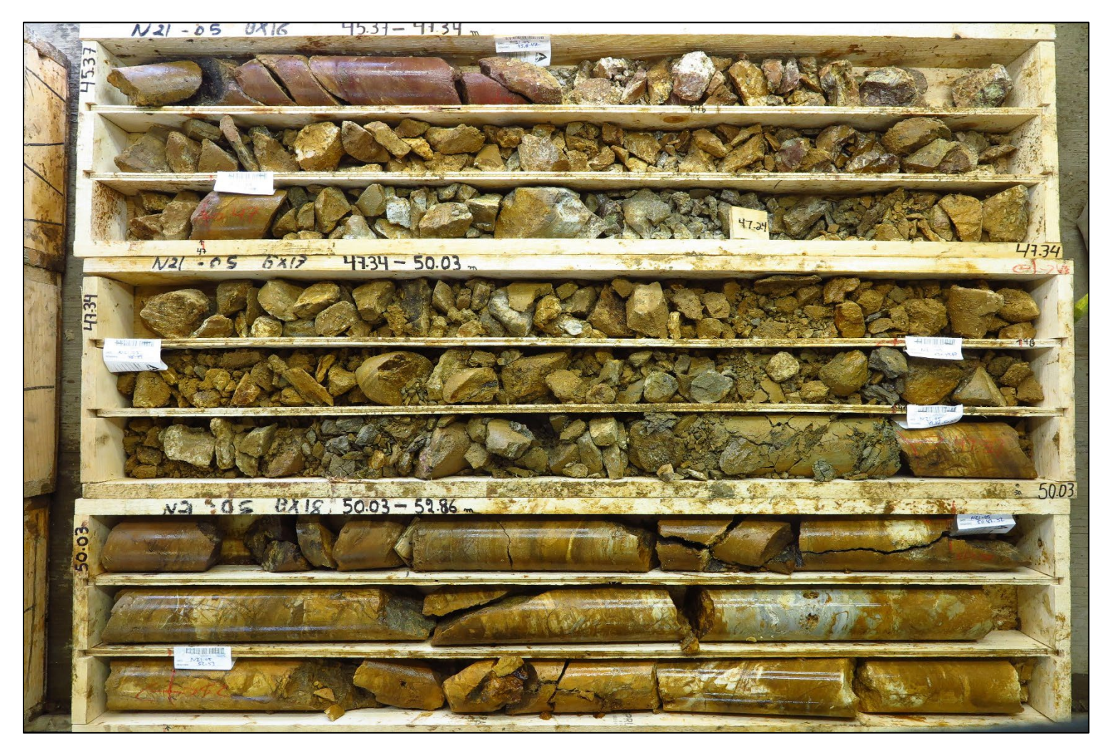
Figure 2. N21-05 Oxide Zone. Interval from 47.00 to 49.00 metres assayed 0.80 g/t.